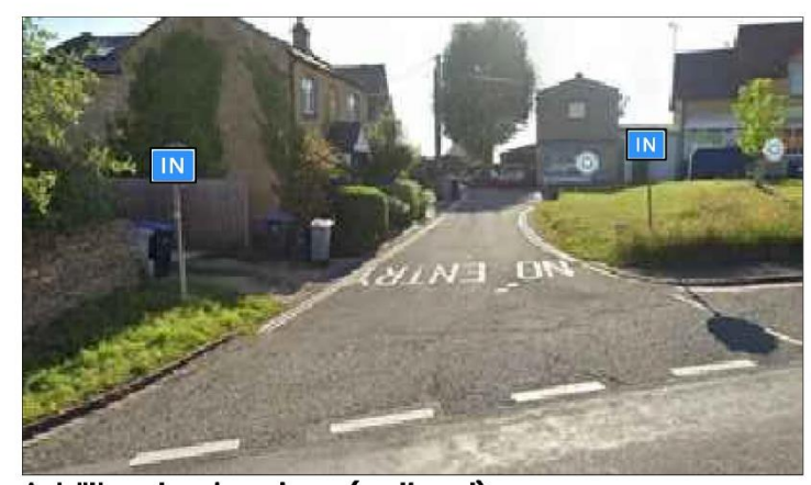
Additional entry signs (optional)

Rev. Date Purpose of revision Drawn Checked Approved