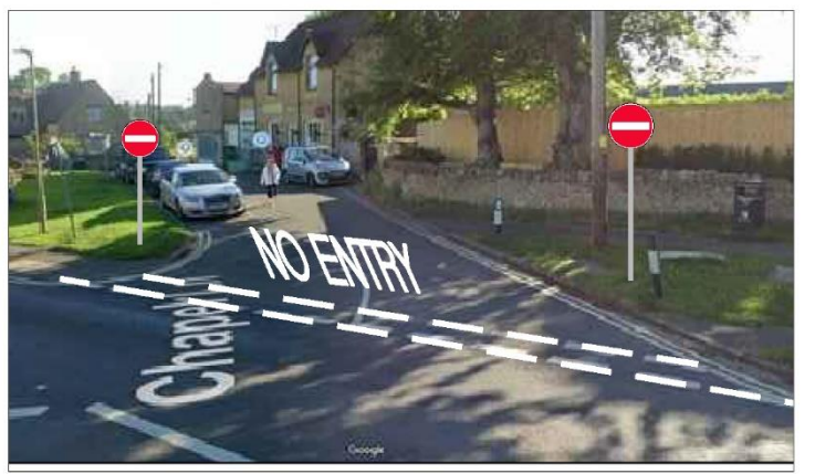
New No entry signs and road markings